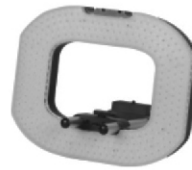
Extra Diffusing Filter